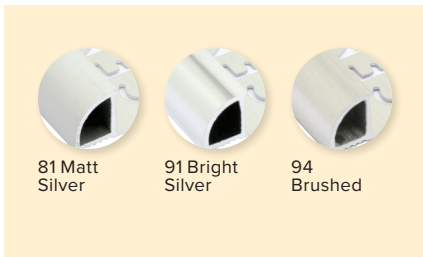
81 Matt Silver